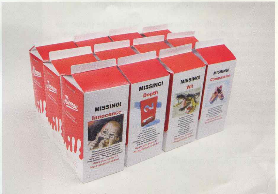
What is Missing Close Up Mixed Media 10" x 4"