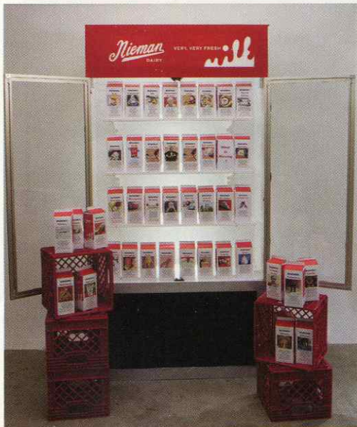
What is Missing Case Mixed Media 70" x 50"

"What Is Missing Case," an installation of a refrigerator full of these cartons, for instance, exists as an art piece with an extremely familiar composition and use. Nieman draws in viewers with this sense of familiarity and tells a narrative with everyday words and pictures.